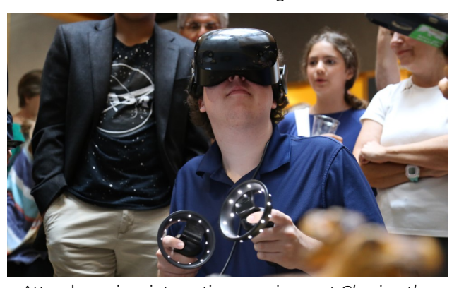
Attendee enjoys interactive experience at Chasing the Moon : Yesterday, Today Tomorrow – A Conversation