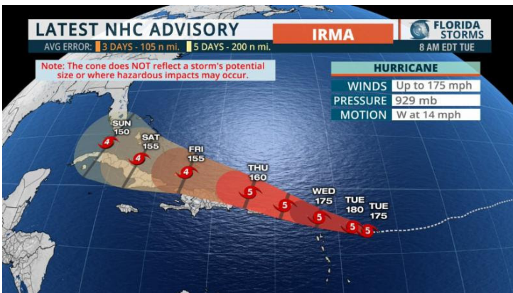
A Florida Public Radio Emergency Network advisory tracks Hurricane Irma's trajectory through the Atlantic

One of the most significant challenges faced by the First Coast in 2017 was Hurricane Irma. As a member of the Florida Public Radio Emergency Network, WJCT News began coverage of the storm via digital assets on August 30, when Irma first formed. The storm rapidly intensified and peaked on September 6 as a Florida-bound Category 5 storm with 185 mile-per-hour winds.