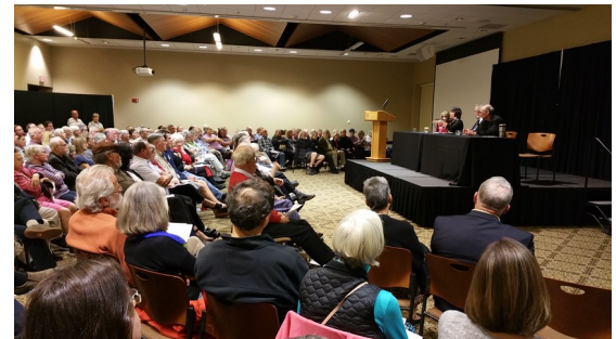
A full house at the Secrets of Spanish Florida Screening at Flagler College in St. Augustine