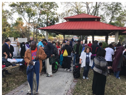
Distribution at Clara White Mission during the 2017 sweater drive