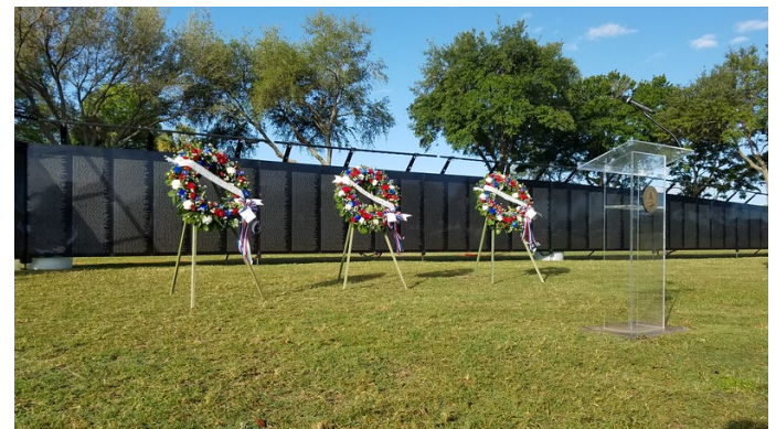
The Wall That Heals is roughly 250 feet long and bears the names of more than 58,000 people who gave their lives

Stories of Service. For the sixth year in a row, WJCT invited First Coast residents to submit veterans' names, then recognized the veterans for their service during on-air and online appreciation spots throughout November. The spots provide a moving tribute to local military.