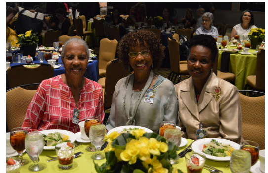
Guests enjoy a healthy lunch at Girls' Day Out 2017