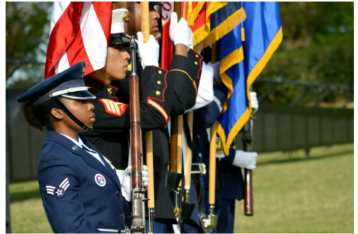
Presenting the colors at The Wall That Heals opening ceremony in Metropolitan Park, Jacksonville

The Wall That Heals was in Jacksonville Thursday, April 13 through Sunday, April 16. 100 guests attended the opening ceremony and 1,500 total guests attended the exhibit during its run.