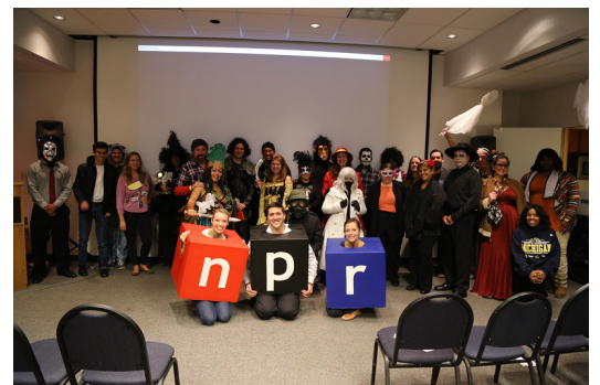
Guests at the WJCT Generation Listen event Tell-Tale Halloween Party