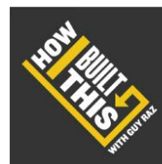
Freakonomics Radio and Planet Money/How I Built This air Sundays from 1-3 p.m. on 89.9 WJCT-FM