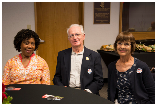
WJCT Volunteer Luncheon 2017