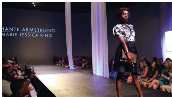
Jacksonville Magazine's Fashion Project was one of the local stories featured on Hometown in 2017