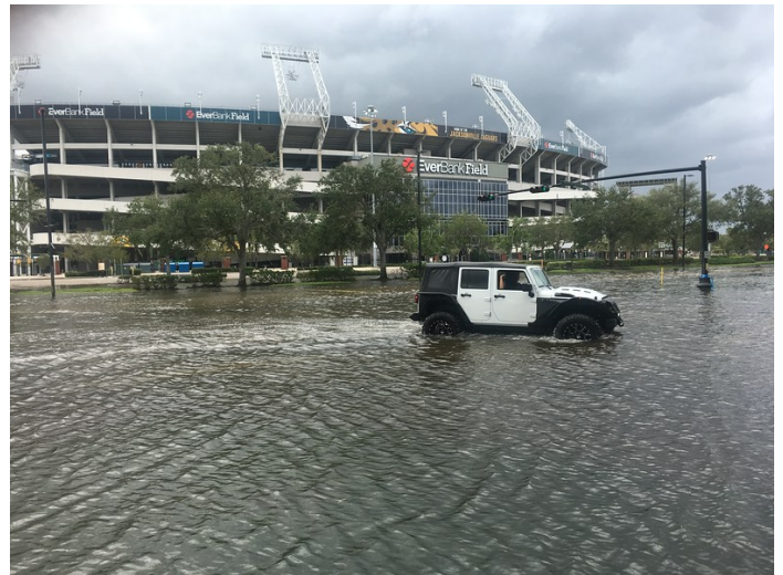
Major flooding occurred in downtown Jacksonville's stadium district, home of WJCT and EverBank Field