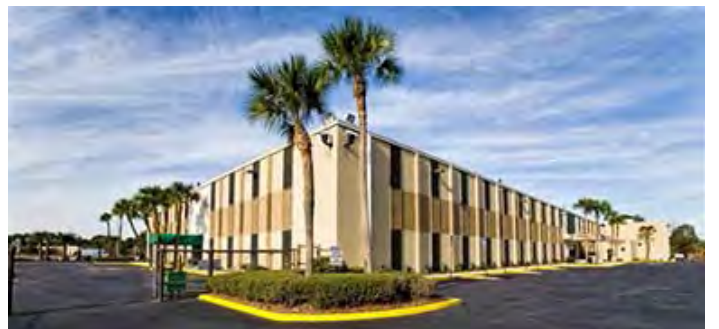
Jacksonville's Cologix, a colocation and disaster recovery provider, houses the DCA's Network Operations Center.

Representatives from most DCA member stations and many other VIPs attended an open house event to celebrate the launch of the NOC. Today, over 16 million households across the country are being served from a single building located in Jacksonville, Florida.