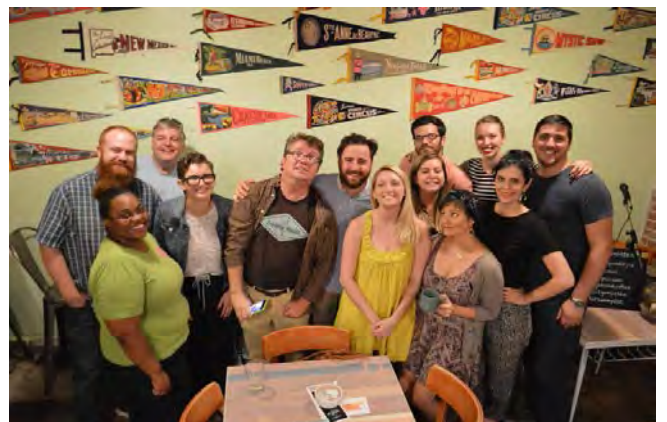
WJCT teams up with local friends Vagabond Coffee and Swamp Radio for a "Gen Listen" event.