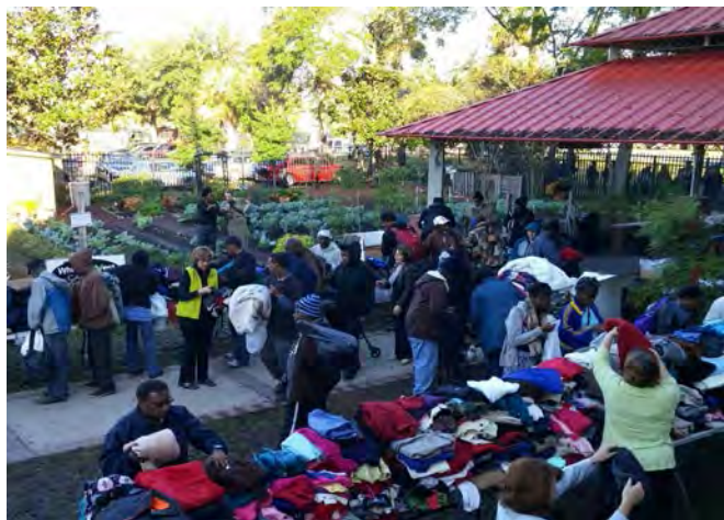
The 13th annual Mister Rogers Neighborhood Sweater Drive.