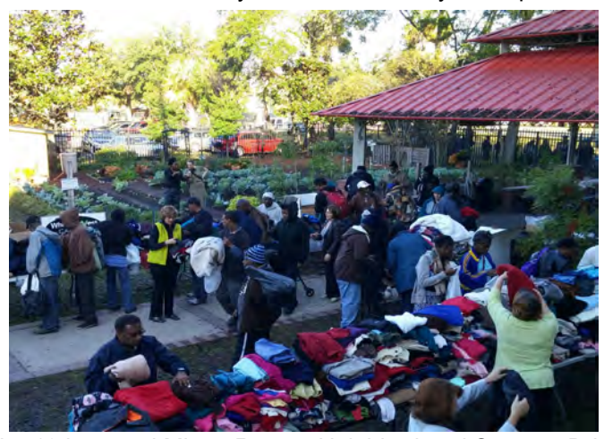
The 13th annual Mister Rogers Neighborhood Sweater Drive.