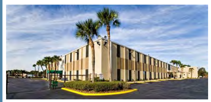
Jacksonville's Cologix, a colocation and disaster recovery provider, houses the DCA's Network Operations Center.

Representatives from most DCA member stations and many other VIPs attended an open house event to celebrate the launch of the NOC. Today, over 16 million households across the country are being served from a single building located in Jacksonville, Florida.